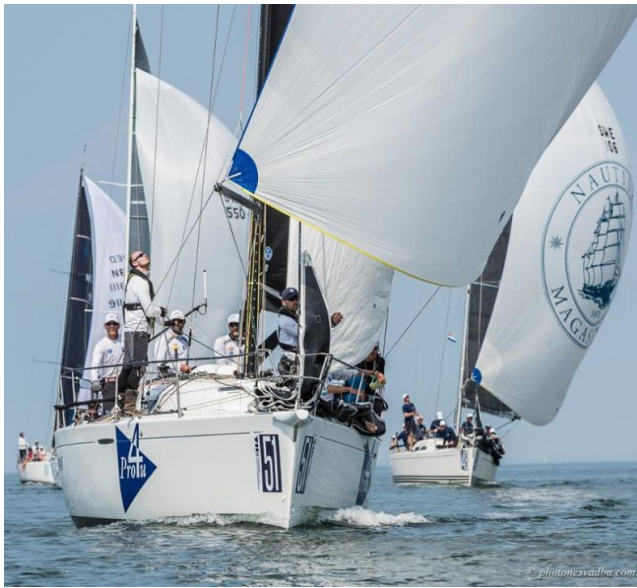
Team Pro4U in Class C action at The Hague Offshore Worlds a year ago