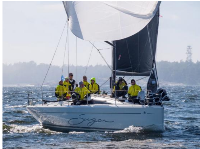
The Sugar team racing on their Italia 9.98 at Baltic Offshore Week