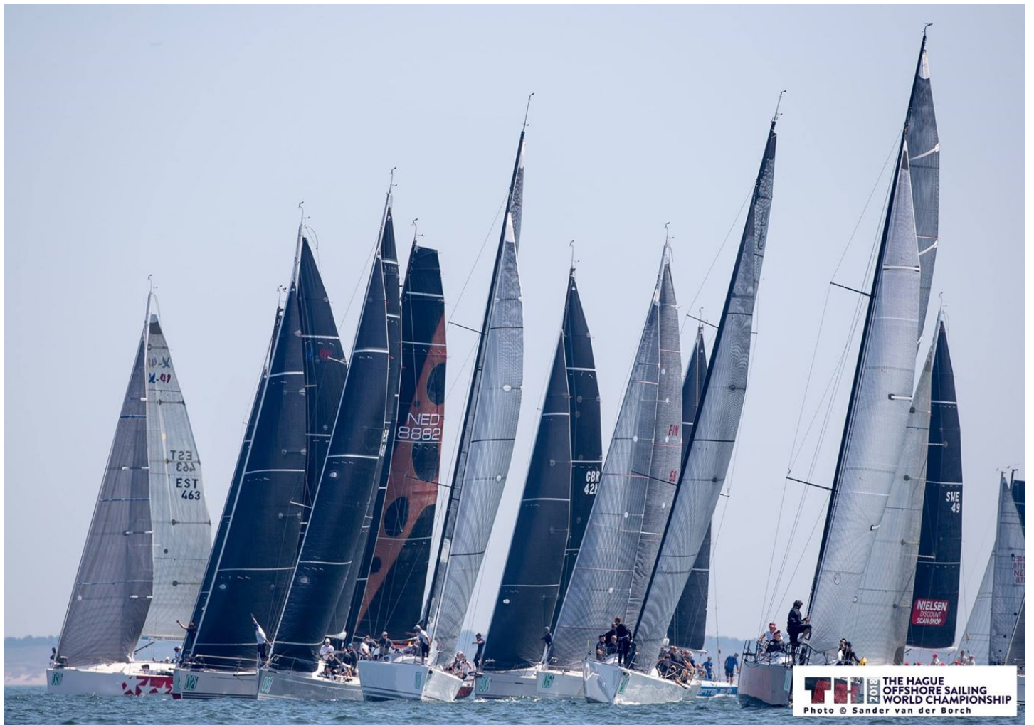
ORC Class B close starting line at the Hague ORC Worlds 2018