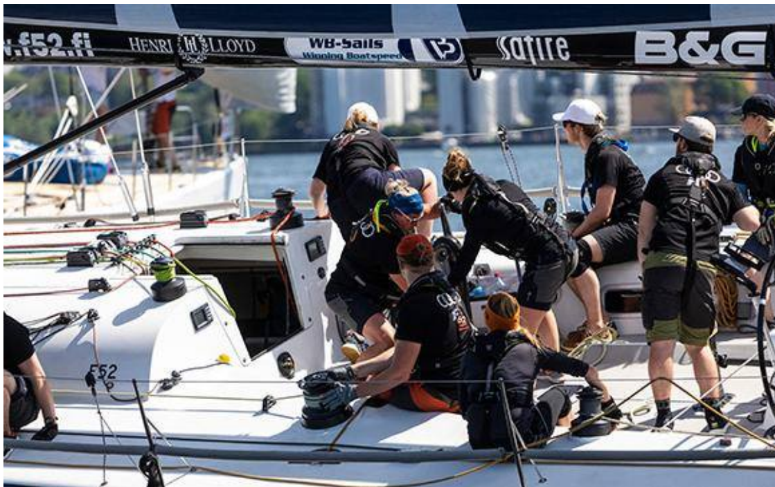
Teamwork on display at the start of the AF Offshore Race on Zer°Emission