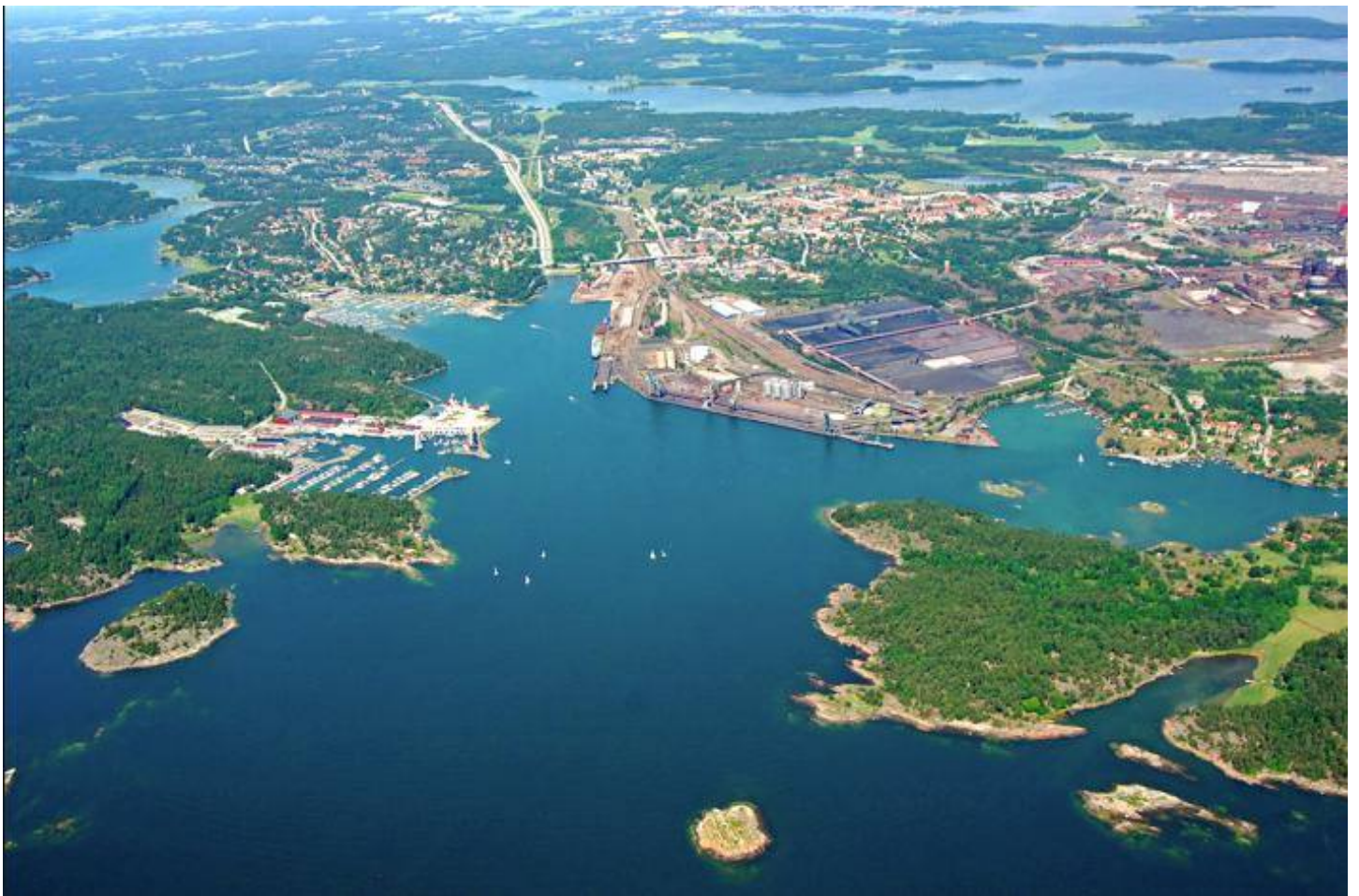
The large harbor at Oxelösund

August 5, 2019 - Oxelösund, Sweden - ORC championship racing ORC championship racing re-focuses from the Med region to the Baltic with next week's start of the ORC European Championship 2019 in Oxelosund, Sweden. Hosted by the Oxelosund Sailing Club , this event held on the eastern coast of Sweden will bring 72 entries from 8 countries throughout Europe to race in three separate classes from Wednesday 14 August to Saturday 17 August .