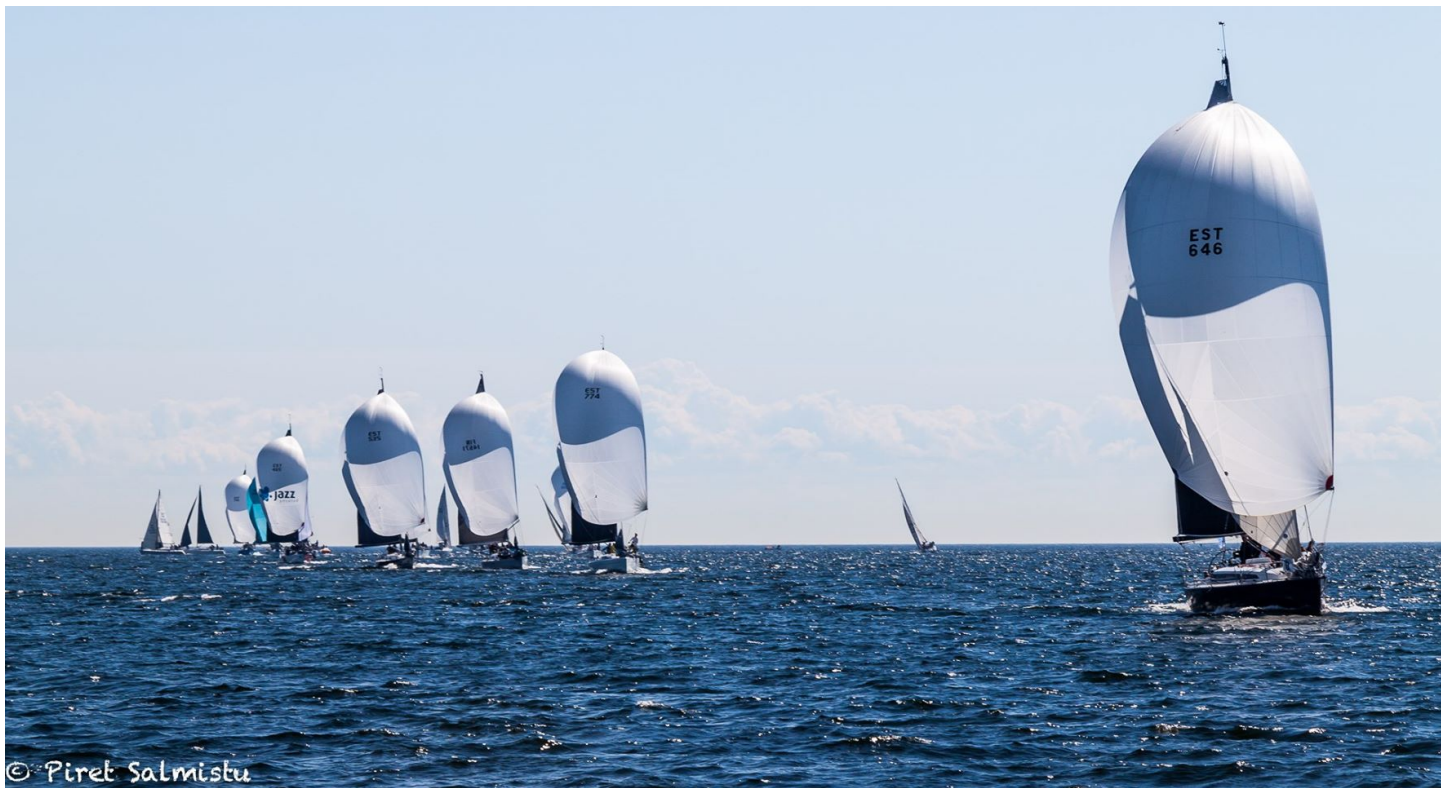
Baltic Offshore Week in June provided valuable training for many Class B and Class C competitors from Estonia and Finland. In front Aivar Tuulberg's Arcona 340 Katariina II

Meanwhile before the start of the racing in Oxelosund, later this week on Thursday 8 August, about 30-40 boats are expected to also compete in the Swedish ORCi Offshore Championship being held at the Royal Swedish Yacht Club (KSSS) in Sandhamn, about 50 miles northeast. This is regarded to be one of the best regatta areas in Sweden and will feature three days of 7 races, including one offshore race and six inshore races.